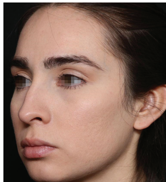
Acne scars improvement in a 22-year-old patient during 3-month follow-up visit (right) compared to baseline (left)