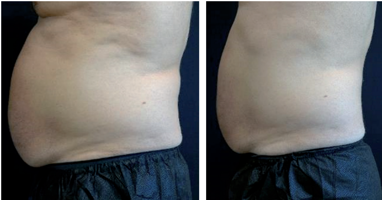
Figure 3: A digital photographs of a 57-year-old male with a BMI of 32.8kg/m 2 taken at baseline (left) and a 1-month follow-up visit (right, an average VAT reduction of 17.0%).