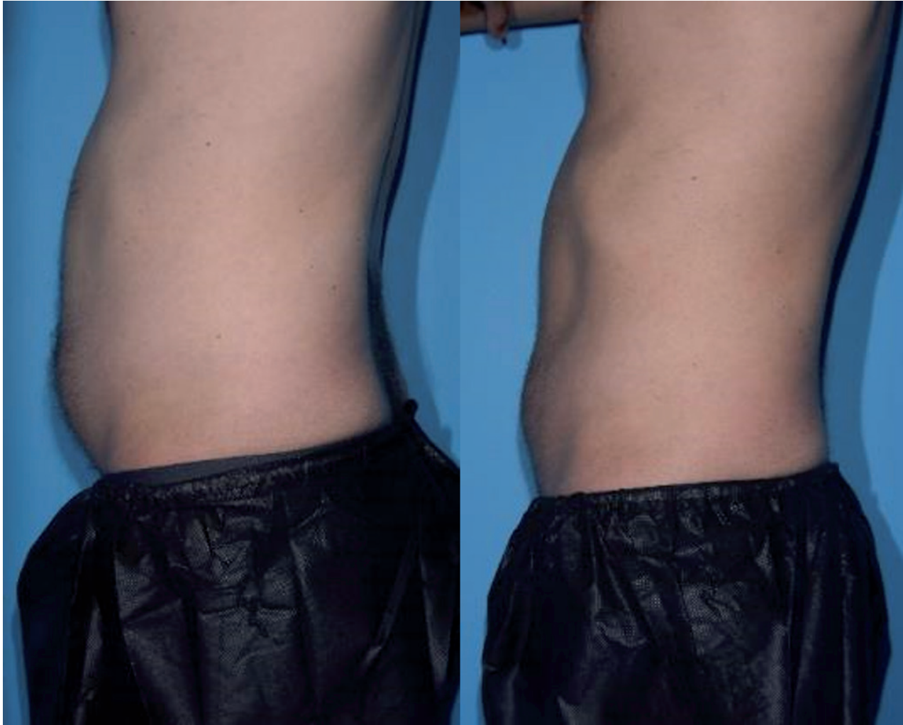
Figure 2: A digital photographs of 34-year-old male were taken at baseline (left) and 1-month follow-up (right, a 14.5% reduction of VAT).