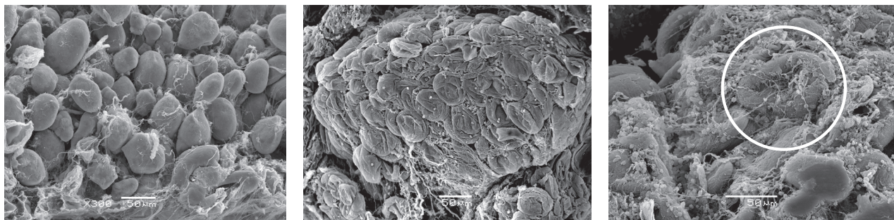
Healthy fat cells with well-defined shape at the baseline (left); shrunk adipocytes with noticeable membrane ruptures occurred at 4 days (center); disrupted adipocytes with extrusion of lipid droplets at two weeks (right)